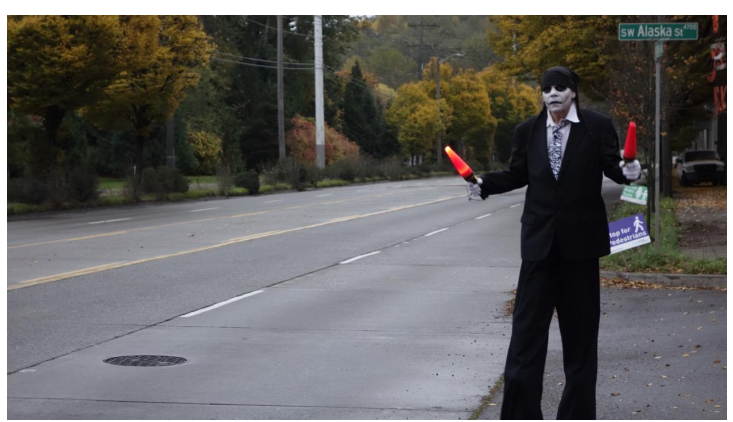
Volunteer crossing guard for community Halloween Party. Scary traffic!