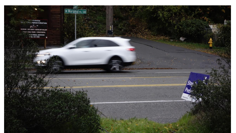
Pedestrians cross here at SW Alaska St from Longhouse to parking at Herring's House Park.