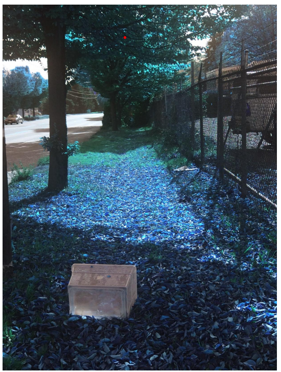
An ADA accessible sidewalk is needed on the west side of West Marginal for access to the Duwamish Trail Route and parking lots.