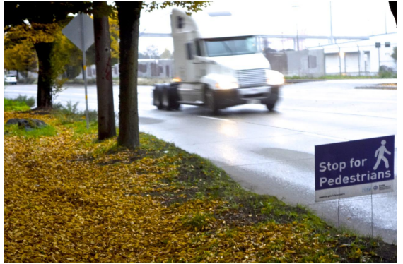
Lots of heavy truck traffic.