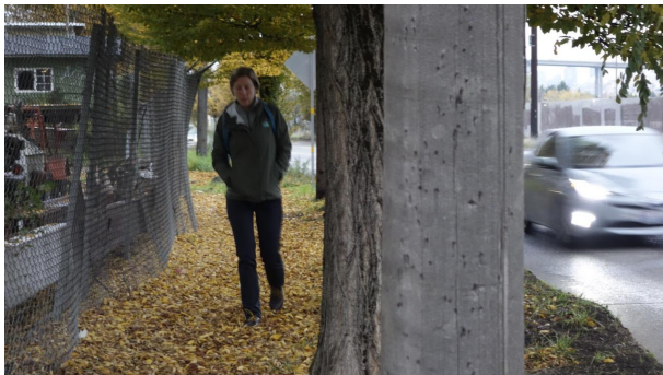
There is only a dirt path on the west side of West Marginal from SW Alaska to SW Idaho. Not ADA accessible, or safe for anyone.