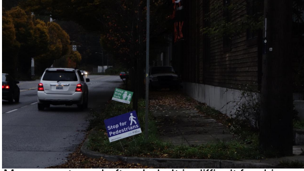
Many events end after dark. It is difficult for drivers to see pedestrians crossing without a marked crosswalk and signal or flashing beacons.