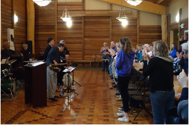
The Duwamish Tribe welcomes the entire community to a wide variety of programs and events.