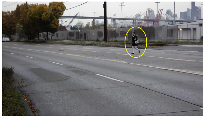
Warning signs and flashing beacons or signal are needed to call attention to pedestrians crossing.