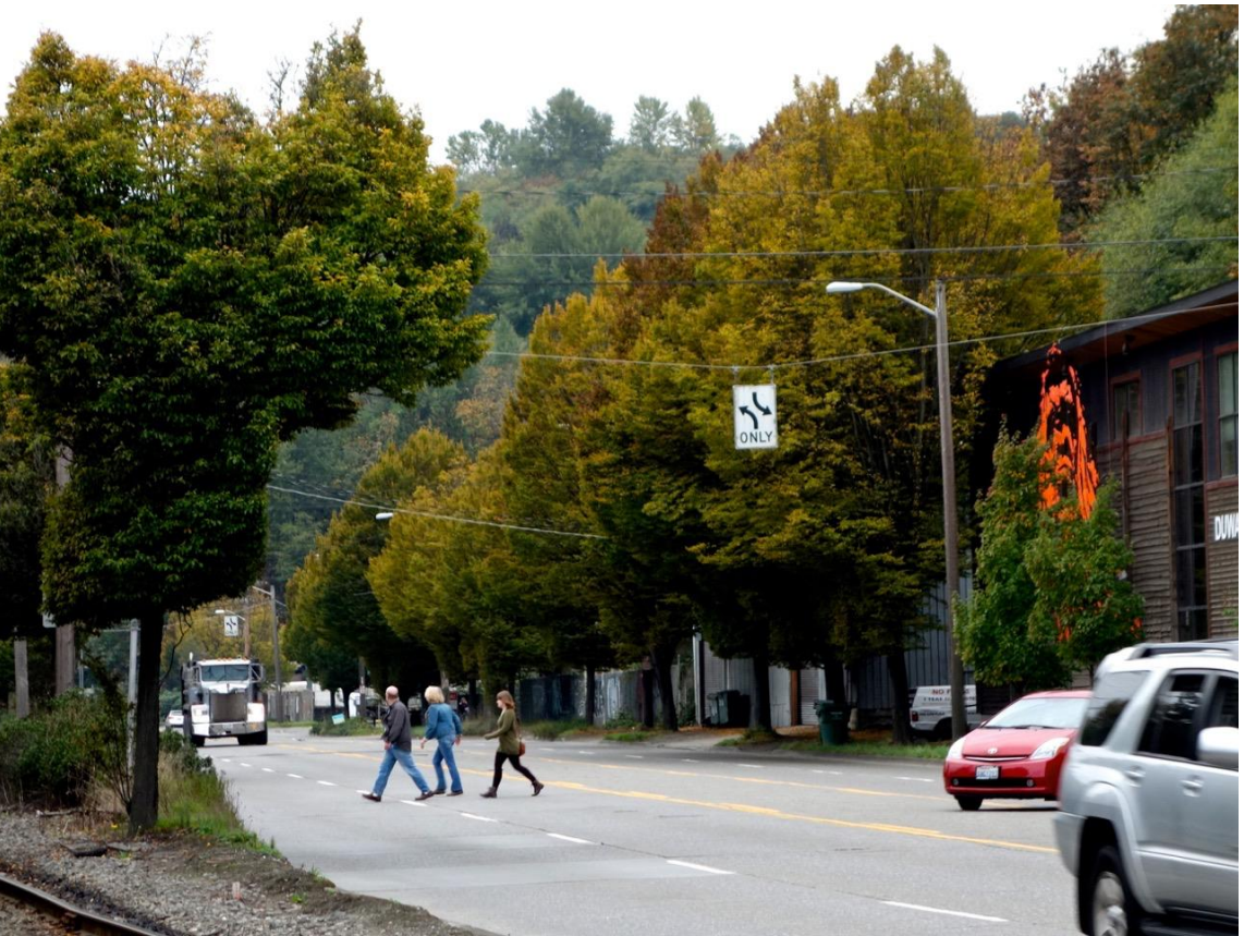
People crossing from Longhouse to park, trail and car parking. 40 mph posted speed limit. Four traffic lanes and a center turn lane. No warning to drivers.