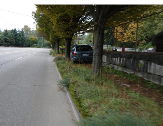
The unpaved path on west side of West Marginal gets muddy, overgrown and blocked by vehicles...