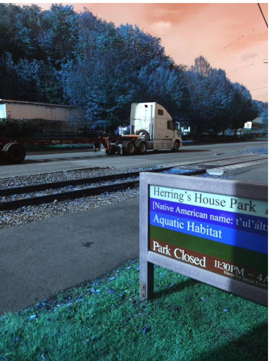
Visitors park at Herring's House and T-107 Parks across from the Longhouse.